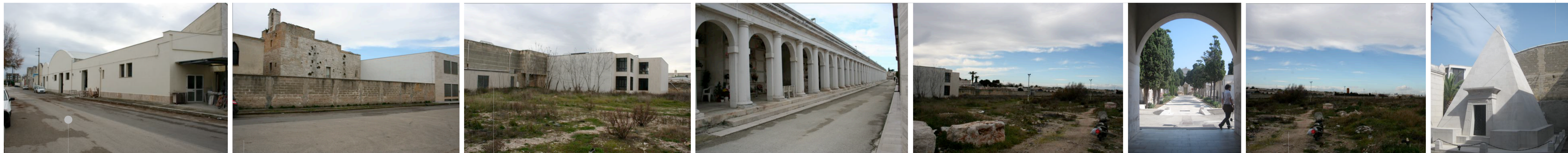
PROSPETTO DI LEVANTE